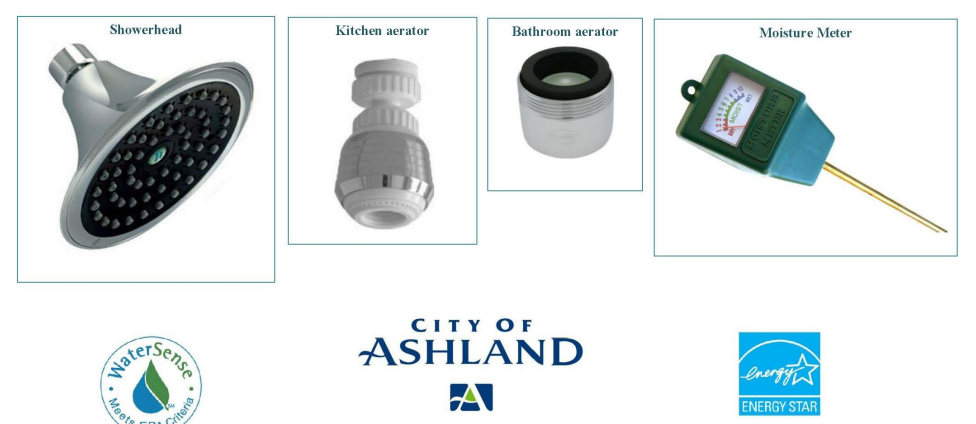
51 Winburn Way Ashland, Oregon 97520

The Water Conservation Department is offering FREE showerheads, bathroom aerators, kitchen aerators, and moisture meters. Come see us in the Public Works Building!