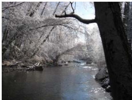
and in Winter