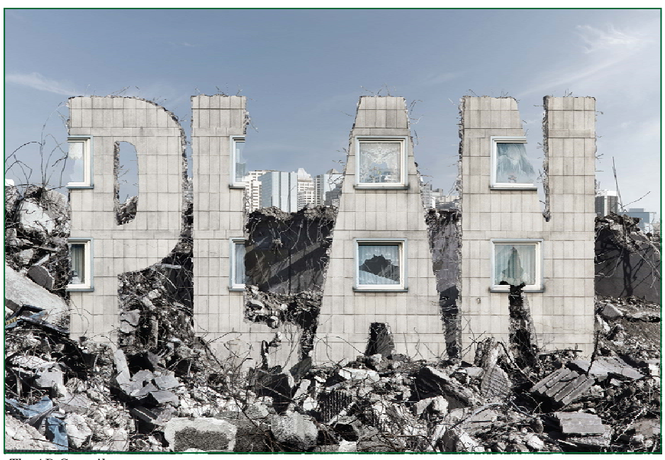
The \ AD \ Council

An emergency preparedness resolution is easy to keep by using the tools and resources available at www.ashlandcert.org and www.ready.gov. At either site, you can learn the four important steps of disaster preparedness: get a kit, make a plan, be informed, and get involved.