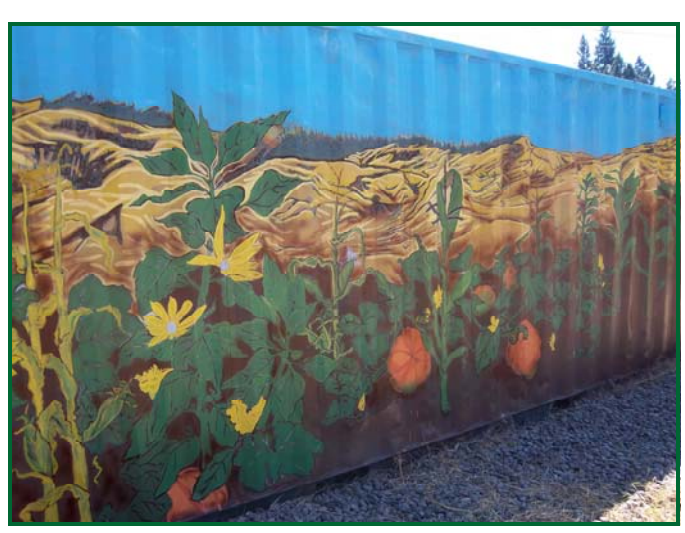
Lincoln Base helps promote Ashland's Community Garden

The art depicts four seasons of companion plants and expresses the goal of the garden to create a community dedicated to practicing sustainable, organic agriculture.