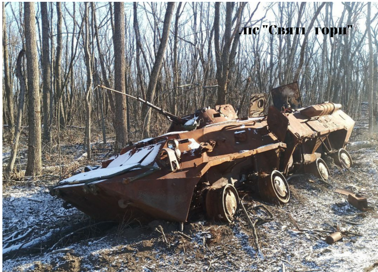
ліс "Святі гори"