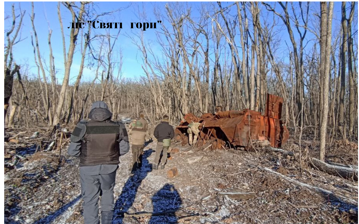
ліс "Святі гори"