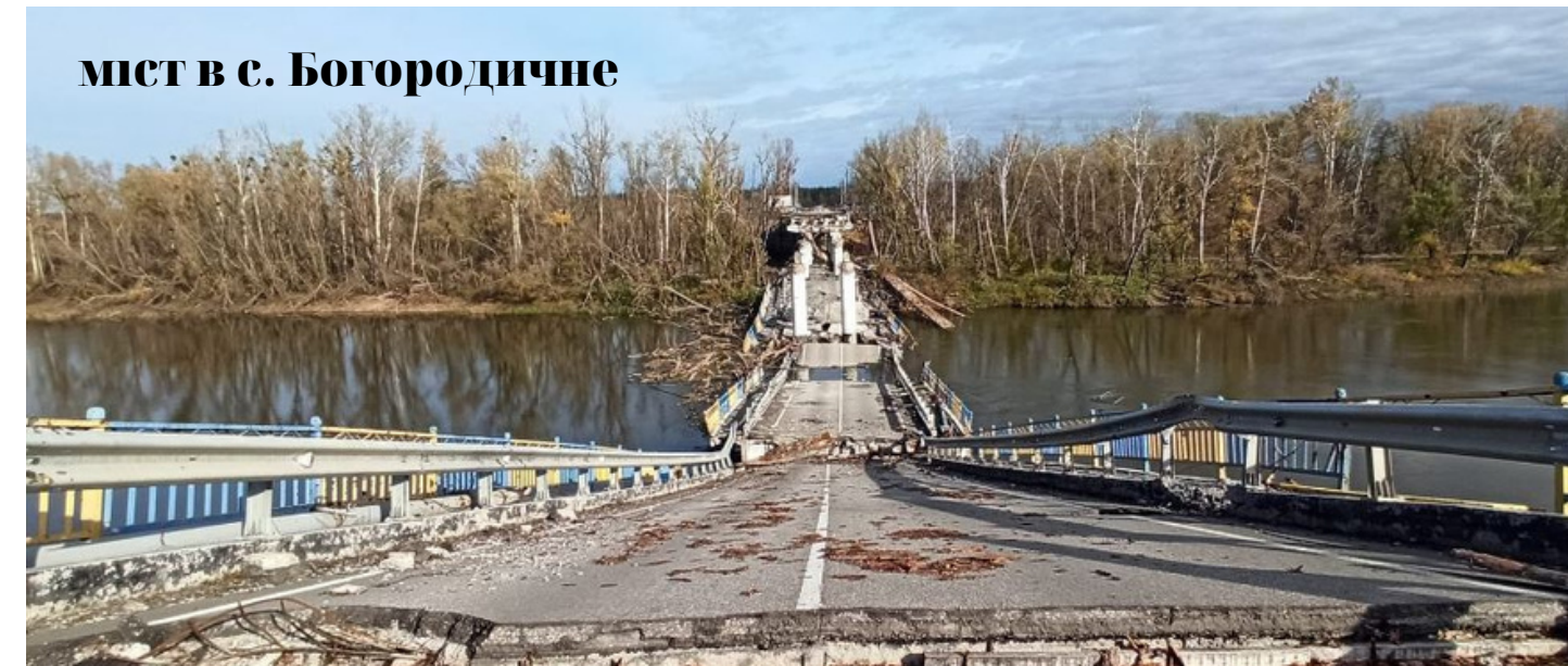
міст в с. Богородичне