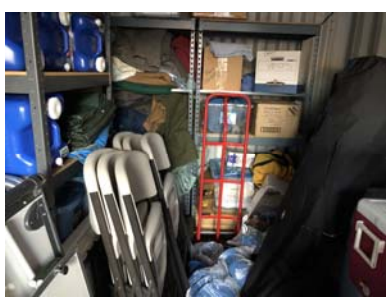
Grove before & after

Sing a joyous song of merry celebration and thanks to your Base Committee members! They have serviced many weekends to bring you this!