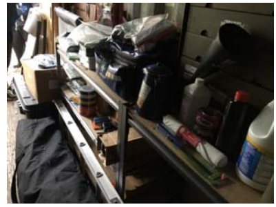
Oak Knoll before & after