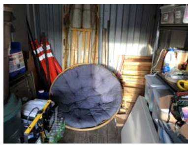
Terra before &