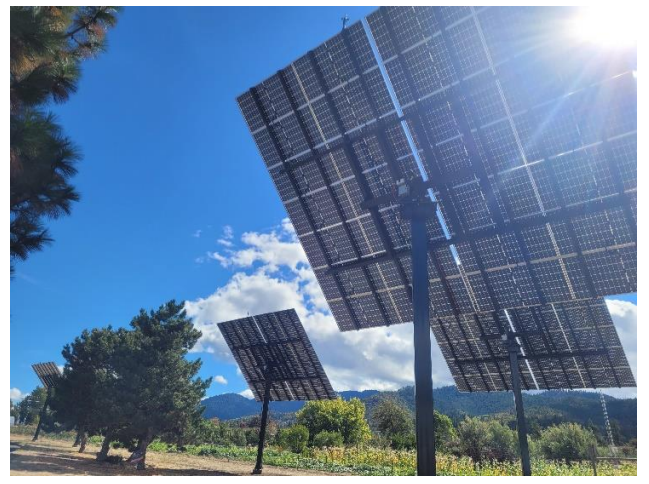
Proposed Dual-axis BiFacial PV Trackers