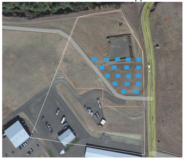
Suggested initial 200kW Layout

If this alternate project is desired, we request the City formally decide to pursue the project, and then provide a Letter of Intent to allow application to ODOE for the CREP grant.