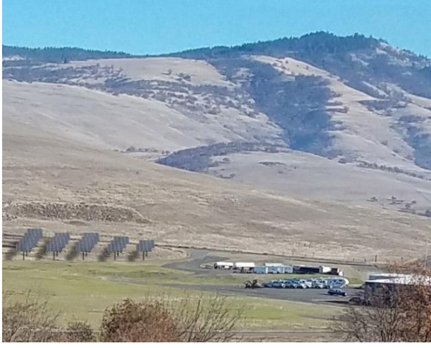
Model Perspective View