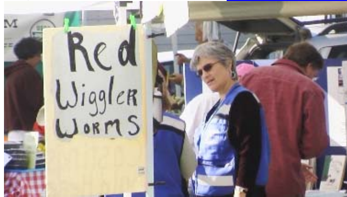
CERT and friends at Farmer's Market