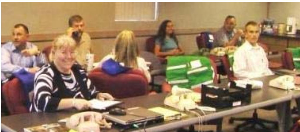
EOC-ICS training in Medford. Next class: October 23 at 1:30 PM

CERT in Josephine County: For information about CERT in Josephine County, their contact phone is: (541) 592-6334. http://www.jococert.org