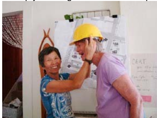
If the Helmet fits...

ValPak: October Map your Neighborhood and coupon for Free CERT Training!