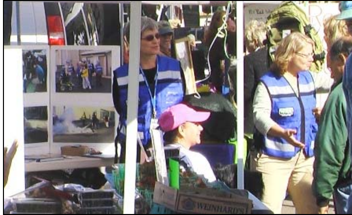
CERT at Farmer's Market September 2008