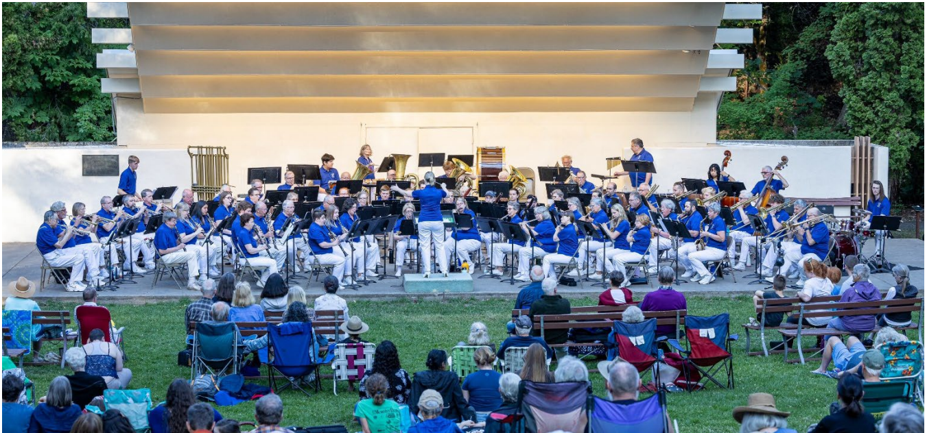
Ashland City Band – First performance of the year on June 15, 2023

The Ashland City Band Concerts will continue on Thursday evenings through August 10, 2023. Enjoy a free concert every Thursday from 7 to 8 p.m., at the Butler Memorial Bandshell in Lithia Park. Bring a picnic dinner, a comfy chair or blanket and don't forget family and friends! A pre-concert ensemble will take place at 6:15 p.m. each Thursday evening. A special Patriotic Concert will be offered on Tuesday, July 4 at Noon. For information on Fourth of July Festivities that are planned by the Ashland Chamber of Commerce, please visit ashlandchamber.com .