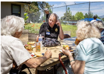
Senior Cookout on June 10