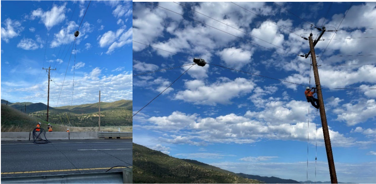
AFN pictures of pulling fiber across I-5